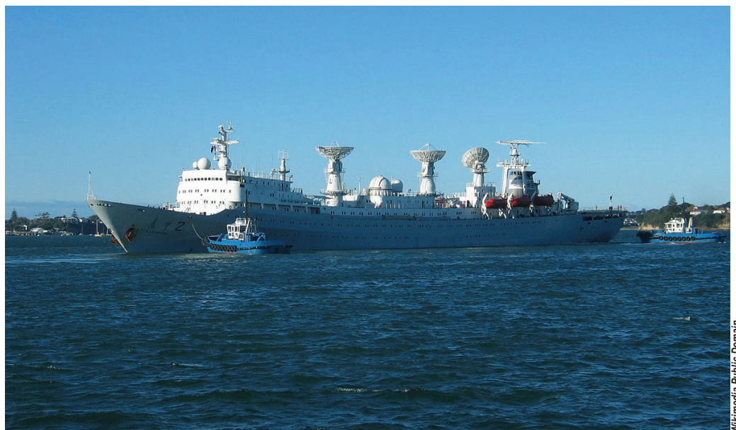
This Chinese Yuan Wang space tracking ship, which supports space launch operations from positions in the Pacific, is part of China’s Space Situational Awareness network.

EW weapons to suppress or deceive enemy equipment. 31 Currently, China has the ability to jam common SATCOM frequency bands and GPS signals, and it has made the development and deployment of satellite jamming systems a high priority. 32 China is further developing jamming systems that will target a large range of commercial SATCOM frequencies, as well as United States military-protected communication bands. 33 The PLA routinely incorporates jamming and anti-jamming techniques against multiple communication systems, radar systems, and GPS satellite systems in exercises. 34 In 2018, the Strategic Support Force even carried out advanced military exercises simulating a complex EW environment with the “[Strategic Support Force] SSF base pitted against five PLA Army, Air Force, and Rocket Force units.” 35