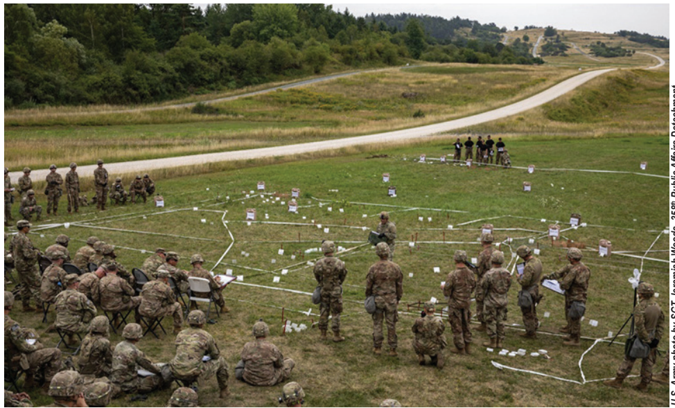
Leadership and staff members from battalions across the 1 st Armored Brigade Combat Team, 1 st Infantry Division, based out of Fort Riley, KS, participate in a combined arms rehearsal prior to a live fire event during Combined Resolve XII on August 5, 2019.

The operational environment has forever changed, and we challenge Army intelligence professionals to now look and think outside the traditional box and present nontraditional injects and analytic processes based on real-world developments and activities. Presume the opposing force will employ GPS and SATCOM jamming during the operation. We must think like, and ahead of, the adversary in order to provide our leadership with greater insight into the