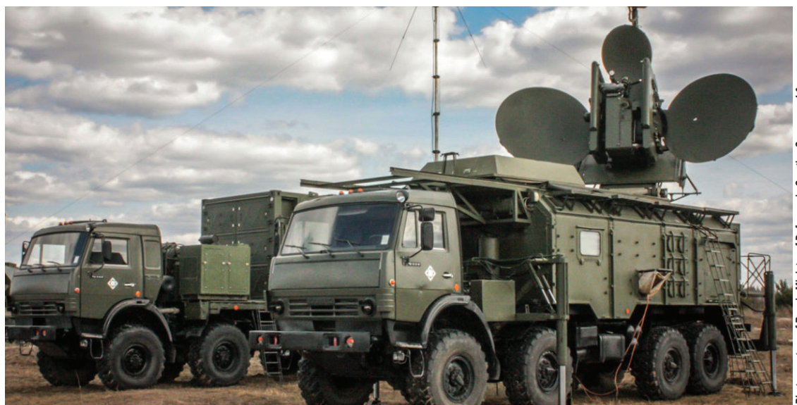
Russia has invested heavily in developing sophisticated electronic warfare capabilities, including this Krashuka-4 jammer.

United States and allied forces operating in areas with known Russian forces must be aware and expect that EW will most likely be encountered, intentionally or unintentionally. Having equipment properly encrypted and knowing the signs of an EW attack will help mitigate the effects. Military intelligence professionals can assist by helping to understand adversaries' EW capabilities and employment tactics, techniques, and procedures, and by anticipating and planning for their effects during the military decision-making process, and more specifically during the intelligence preparation of the battlefield (IPB) process. Putting forth an inject of jammed SATCOM or GPS during unit training and exercises will cause the planners, operators, and leaders to think about how military operations are affected by this asymmetric threat, and their response to these non-kinetic effects. As intelligence professionals, it is our responsibility to account for and characterize adversary non-kinetic capabilities and potential effects, and the way in which they enable adversaries' kinetic capabilities in support of their broader military operations.