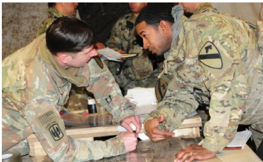
Over several days 1 st Armored Brigade Combat Team, 1 st Cavalry Division leaders, through the military decision-making process, planned and rehearsed for Combined Resolve, a live-fire exercise as part of their Atlantic Resolve rotation across Europe, which is to improve the interoperability between U.S. forces and their North Atlantic Treaty Organization allies and partners.