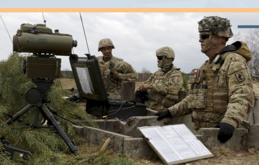
Soldiers with the 173 rd Infantry Brigade Combat Team observe an impact zone from a forward observation point during Dynamic Front 2019 in Torun, Poland, March 2019.

The TPP will highlight a first of its kind tactical cross domain solution internal to the system, which allows intelligence data to seamlessly move across security enclaves to deliver information that supports fires, maneuver, and mission command. In addition, the TPP employs automation of intelligence fusion, target recognition, identification, and geolocation from multiple sensors. The automation allows for leveraging mature artificial intelligence and machine learning technology to reduce the sensor to shooter timelines, generate target nominations, and fuse the common intelligence picture. Early employment and demonstration of the TPP also supports and informs the TITAN PoR (managed under PM IS&A) by providing lessons learned, design details, and Soldier feedback to PM IS&A during early prototyping. The TITAN PoR will leverage some components of the TPP through the Space Ground Component Kit.