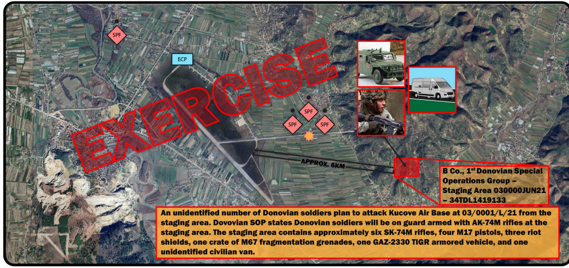
An example exercise enemy course of action centered on a complex small arms fire attack generated by collected intelligence from exercise role players during tactical questioning interrogations.

The DEFENDER-Europe 21 threat network, consisting of 3<sup>rd</sup> Infantry Battalion and 709<sup>th</sup> Military Police Battalion role players, replicated near-peer threats and malign actors. Within the scenario, the network consisted of a platoon-size element of Donovian Special Purpose Forces, Donovia, as the exercise's adversarial country threat. Role-player packets were developed, translated, and disseminated to the assigned OPFOR. The IDEX Operations Branch and 66<sup>th</sup> MI Brigade-Theater provided additional training to ensure all role players understood the expectations, biographical information, and safety considerations. Points of capture with accompanying capture circumstances and a detainee collection point were part of the scenario to exercise intelligence reporting and battle tracking.