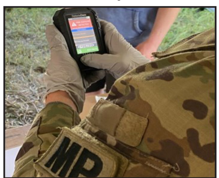
Explosive residue tests for the exercise were conducted by 527<sup>th</sup> Military Police Company Soldiers using the SEEKERe, an automated colorimetric handheld device.

Explosive residue testing generated real-time test summaries of role players for submission to the DEX training portal. Explosive residue submissions generated an identification match (positive hit) or a non-identifiable result (negative hit) to assist in intelligence production and operations and in commander's decision making.