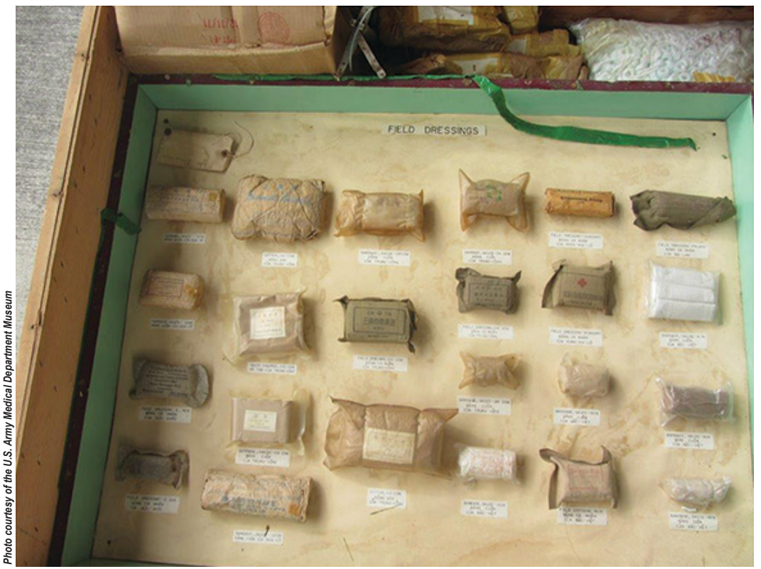
Technical intelligence board of captured medical supplies, Vietnam.