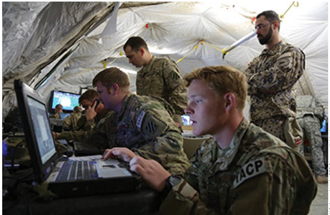
U.S. Soldiers of the 1 st Armored Brigade Combat Team, 3 rd Infantry Division, provide information to ground units from the tactical operations center while a Latvian soldier, right, observes during exercise Combined Resolve IV at the U.S. Army's Joint Multinational Readiness Center in Hohenfels, Germany, May 17, 2015.

Today's ISR capabilities are also increasingly complex and rapidly changing with technology. There is little expectation that a junior captain can be a subject matter expert in what these ISR assets can or cannot collect. Therefore, it is important to integrate the brigade's warrant officers into collection management planning. The brigade's military occupational specialty (MOS) 352N (Signals Intelligence Analysis Technician), MOS 351M (Human Intelligence Collection Technician), and MOS 131A (Field Artillery Targeting Technician) are especially critical. For example, unused by most brigades is the ability for the Q50/53 counterfire radar to be employed as an ISR asset by reporting lines of bearing whenever enemy counterfire radar transmissions are detected. Without input from these warrant officers, these nonconventional ISR assets will not be in-