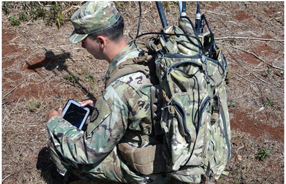
An electronic warfare specialist with 2 nd Brigade Combat Team, 25 th Infantry Division, operates a Versatile Radio Observation and Direction finder at Schofield Barracks, HI.

As the U.S. Army continues training BCTs for large-scale war, we must relearn many of these fundamentals of large-scale ground combat operations so that we can maxi-