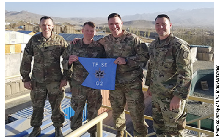
Advisors from the 1st Security Force Assistance Brigade S-2 team during their 2018 deployment to Afghanistan.

With the brigade S-2 section providing senior leadership and mission command to the Task Force Southeast G-2 section, all 35Ts (Military Intelligence Systems Maintainer/Integrator) and 35Gs (Geospatial Intelligence Imagery Analyst) were leveraged to augment the Task Force Southeast's intelligence and electronic warfare and geospatial intelligence mission command and advising function. The MI company command team handled day-to-day institutional advising of the 203<sup>rd</sup> Corps and MI kandak while the brigade S-2 officer in charge functioned as both the Task Force Southeast G-2 and the primary advisor for National Directorate of Security senior leaders in the seven provinces encompassing the area of responsibility. Because 1<sup>st</sup> SFAB